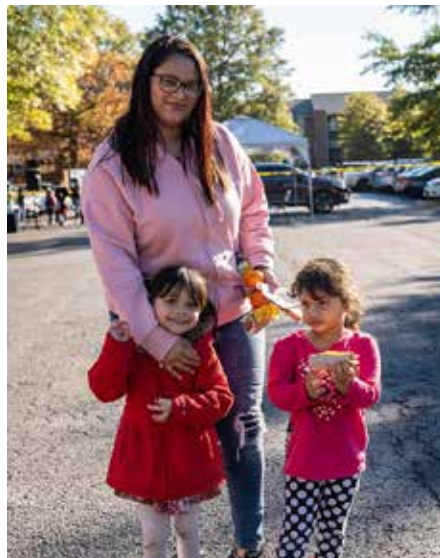
A family shows off their caddisfly artwork at the Waterkeepers of Little Hunting Creek Day of Action.

ANS partners with local community-serving organizations to grow a network of empowered environmental leaders who feel connected to their local natural spaces and gain the skillsets and confidence to represent neighborhood priorities to decision-makers.