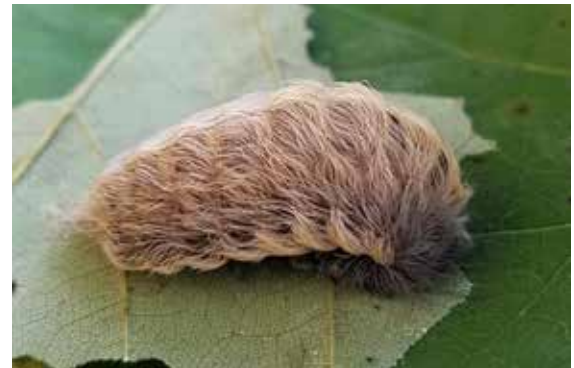
The Puss caterpillar, Megalopyge crispata, is protected by long hairs and venomous spines that can give unwary predators (or people!) quite a sting.