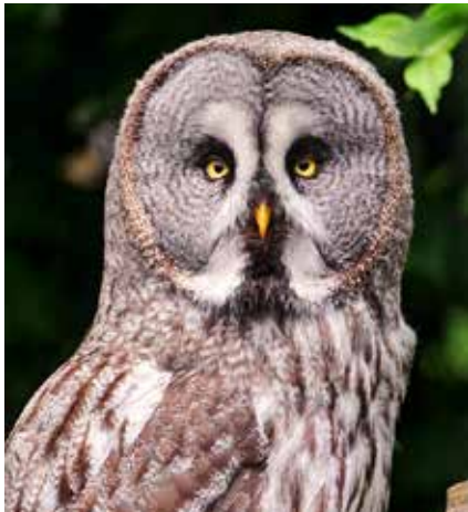
Great Gray Owl: Photo by Tambako The Jaguar/Flickr (CC BY-ND 2.0)

Join us as we explore the iconic forests, bogs, and Lake Superior shoreline of northern Minnesota to search for birds and other animals that make this wonderland their winter home. On this long weekend we'll be based in Duluth and travel through rich and varied habitats, scanning the trees and brush for such amazing birds as Great Gray Owl, Northern Hawk-Owl, and Snowy Owl. We also search for the winter finches often found in the region, such as Pine and Evening Grosbeaks, Red and White-winged Crossbills, and Common (and with luck Hoary) Redpolls. Ruffed, Sharp-tailed and (rarely) Spruce Grouse, woodpeckers, Canada Jay, Northern Shrike, Bohemian Waxwing and Boreal Chickadee are also on the list of species we'll spend time looking for as we drive the back roads. While the total trip list will fall well short