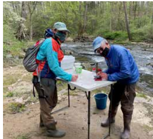
Monitoring at Little Patuxent in the time of Covid (Spring 2021).

* These classes are required for all volunteer monitors.