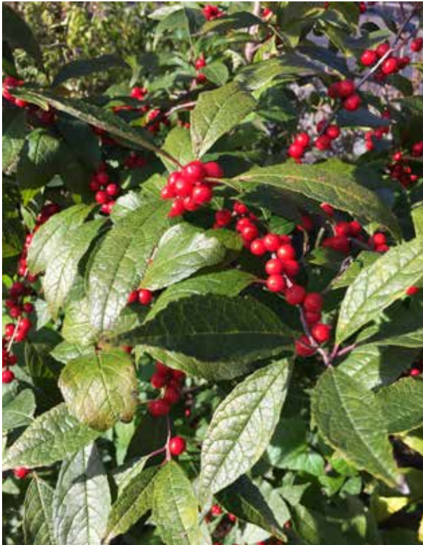
Winterberry at Woodend