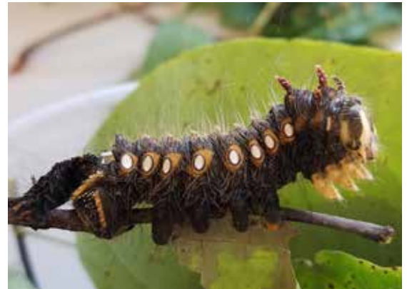
The Imperial moth caterpillar, Eacles imperialis , is one of the largest caterpillars in the Eastern US and one of several species of giant silk moths.