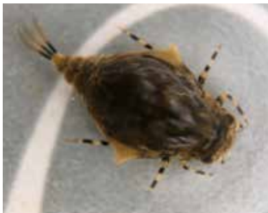
Armored mayfly

Wednesday, October 2 (7-9:30 pm) Woodend Sanctuary, Chevy Chase, MD