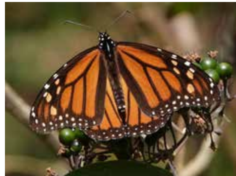
Mark S. Garland

Cape May is an astounding place to witness autumn migration. Under the right weather conditions, a single day can bring several thousand southbound hawks, tens of thousands of migrating songbirds, and thousands of Monarch butterflies onto the southern tip of New Jersey. Waterfowl, herons, dragonflies and even bats also travel through Cape May in October. Under the guidance of an expert naturalist and birder who's a local, we'll visit many of the diverse natural areas around Cape May and celebrate the rich spectacle of fall migration. Overnight options include hotels, B&B's, owner