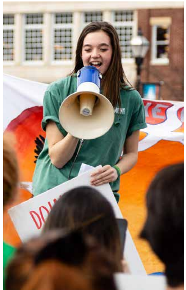
Maryland students raise their voices for action on the Climate Crisis at a rally in Annapolis.