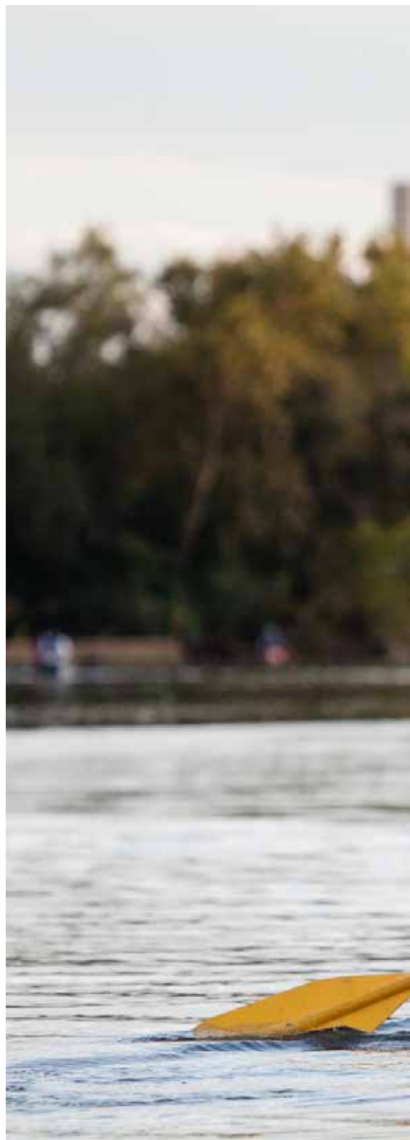
Pepco's Benning Road Power Plant burned coal and later, starting in 2014, it was located in a historically African-American neighborhood. It emitted pollutants such as iron, cadmium, zinc, iron, dust and soot, and other hazardous materials.