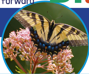
EASTERN TIGER SWALLOWTAIL

One of the most common eastern butterflies.