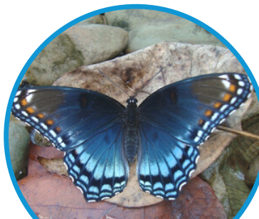
RED SPOTTED PURPLE