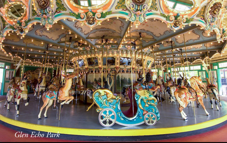
Glen Echo Park