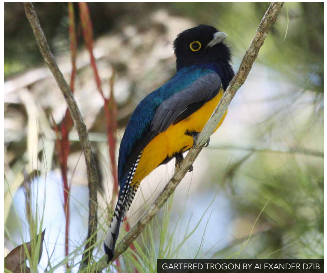
GARTERED TROGON

Participants should be in good physical condition and able to walk unassisted for several hours per day. Binoculars are needed for this program. We recommend wide angle binoculars, something within the range of 7x35, 8x40 or even 10x50 with good light gathering characteristics. Although light and comfortable, pocket binoculars don't work as well in low light conditions.