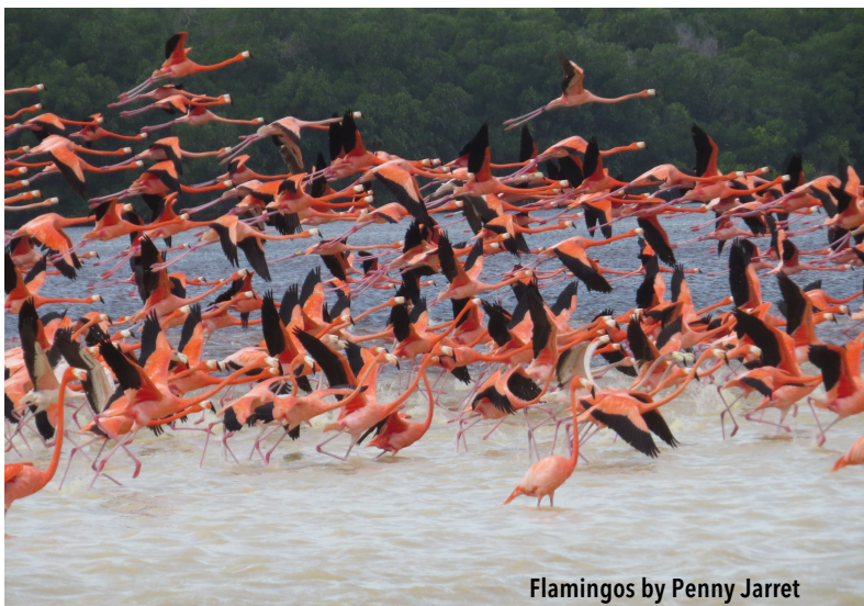
Flamingos by Penny Jarret