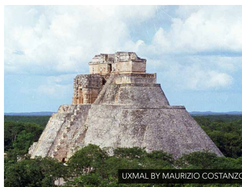
UXMAL BY MAURIZIO COSTANZO