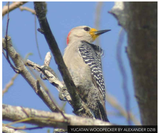
YUCATAN WOODPECKER BY ALEXANDER DZIB