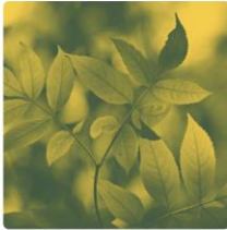
PLANT IT FORWARD