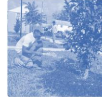
READ THE LEAFLET