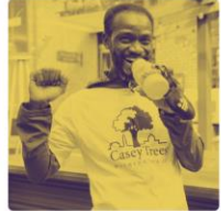
DOWNLOAD THE ADVOCACY HANDBOOK