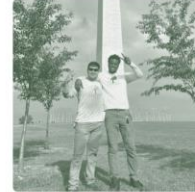
TAKE ADVOCACY 101