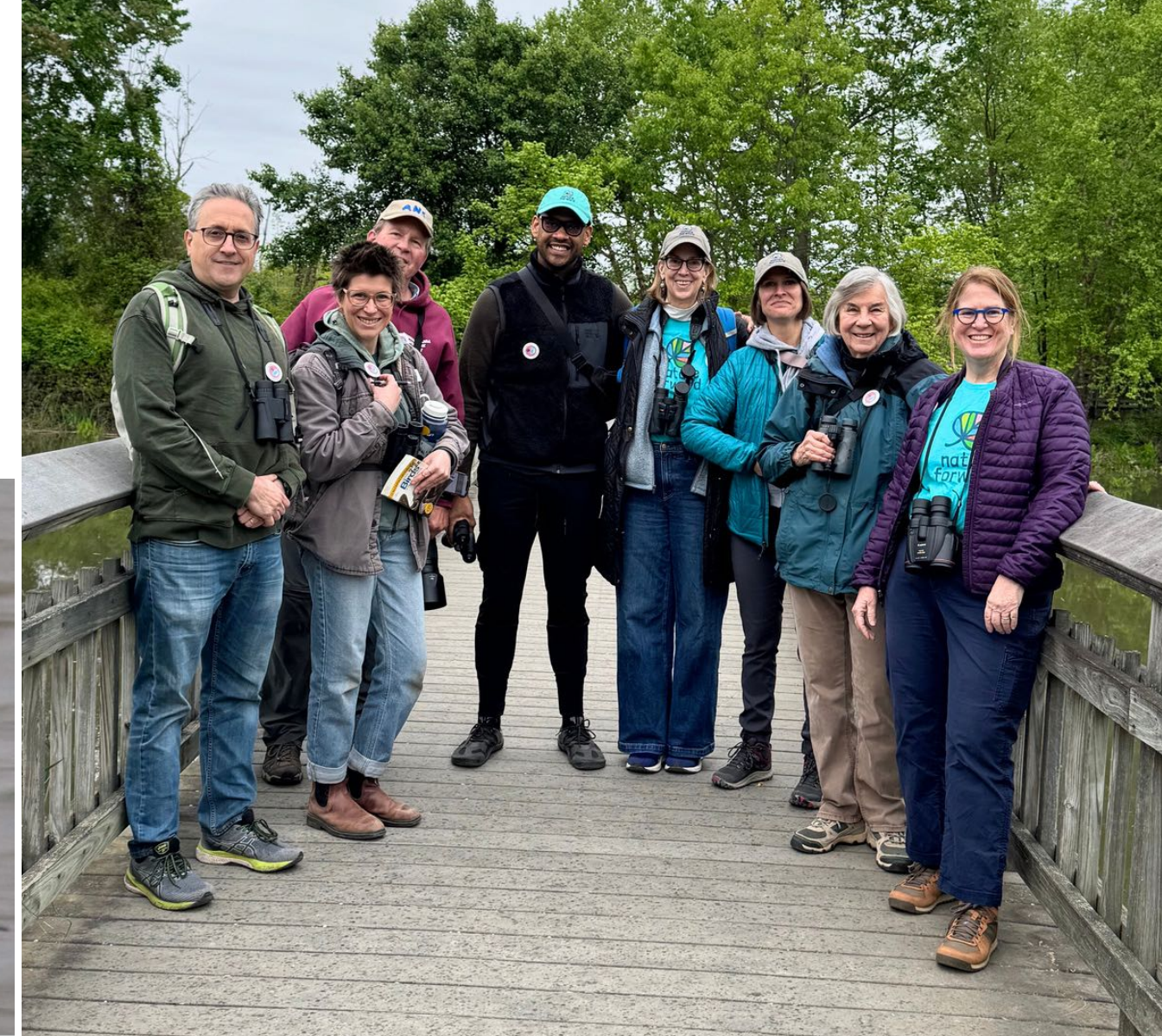
Members of the 2024 Nature Forward Board Birdathon Team