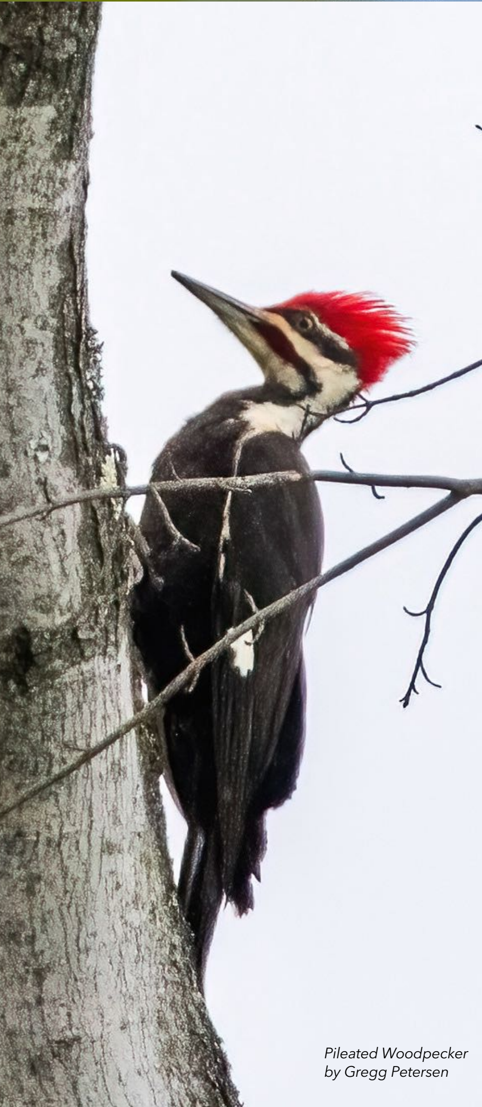
Pileated Woodpecker by Gregg Petersen