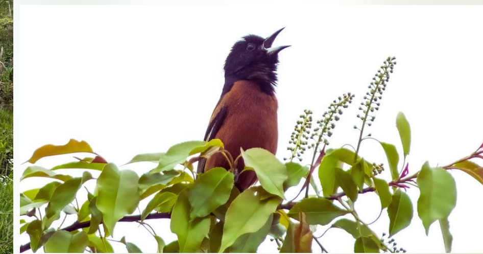
Solitary Sandpiper (top) and Baltimore Oriole by Gregg Petersen