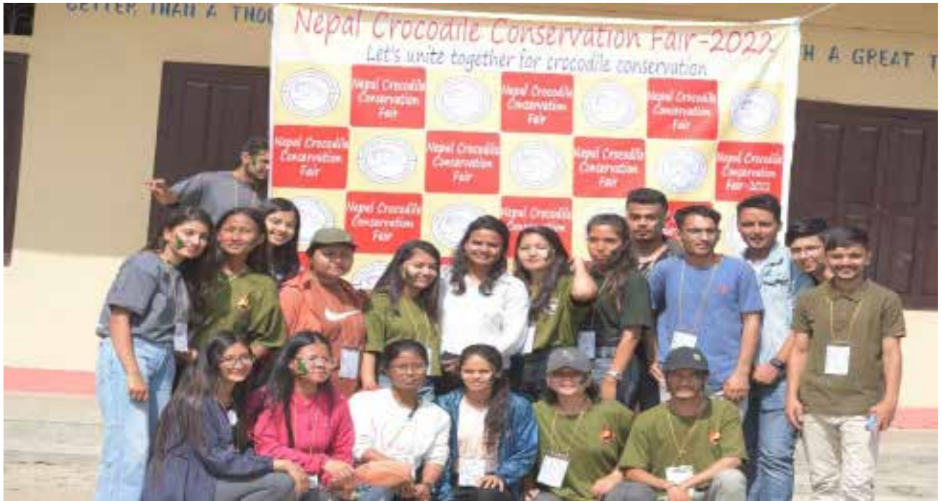
Youth participate in Crocodile Fair and learn about the Gharial long-snouted crocodile and conservation efforts, Nepal. Picture submitted by grantee.