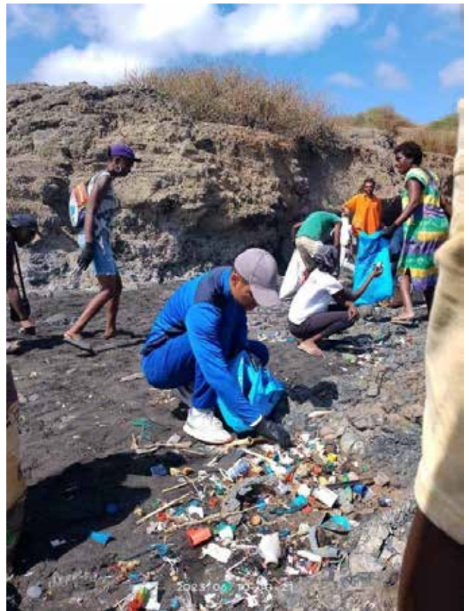
Clearing debris from beach to protect endangered seas turtles, Cape Verde.