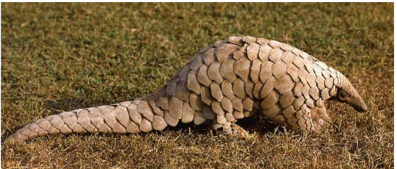
Indian pangolin