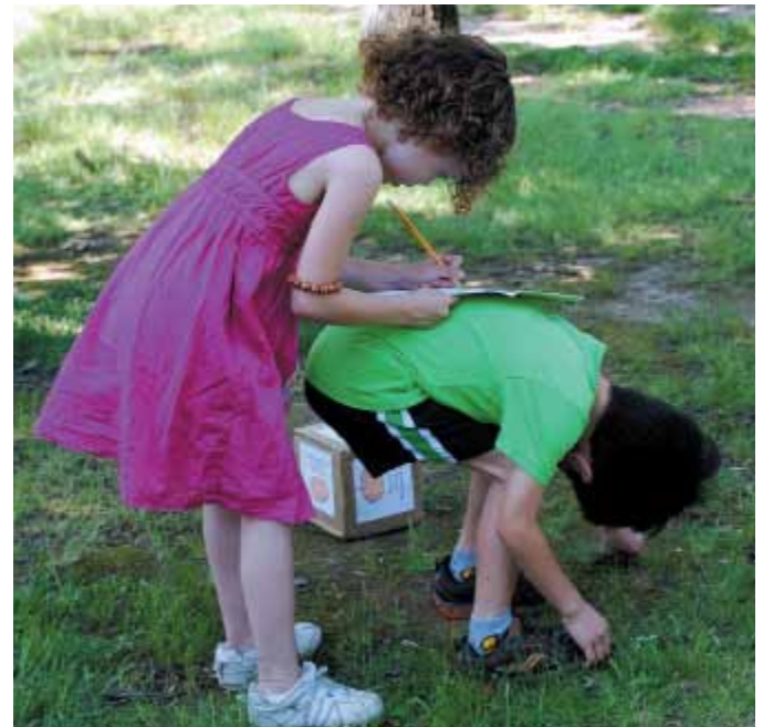
Silver Spring, MD, first-graders work together to record data during a GreenKids water cycle investigation.