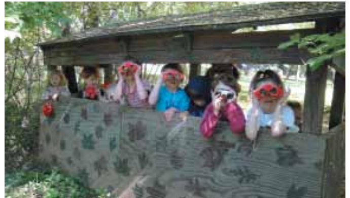
Nature Preschoolers learn to identify some of Woodend's most loyal visitors — robins, chickadees, and cardinals.

ANS GreenKids Program in Montgomery and Loudoun County Public Schools was made possible this year through generous support from the Environmental Protection Agency, Howard Hughes Medical Institute, National Oceanic and Atmospheric Administration, TogetherGreen, the Wallace Genetic Foundation, and restricted gifts from individual donors.