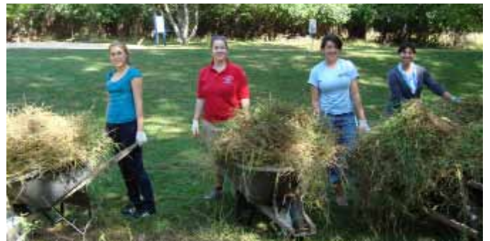
Volunteers from the Connelly School of the Holy Child in Potomac, MD, help clear Woodend Sanctuary of invasive plants.